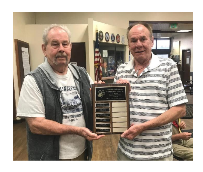
Most Cultural Award - We had a Tie!