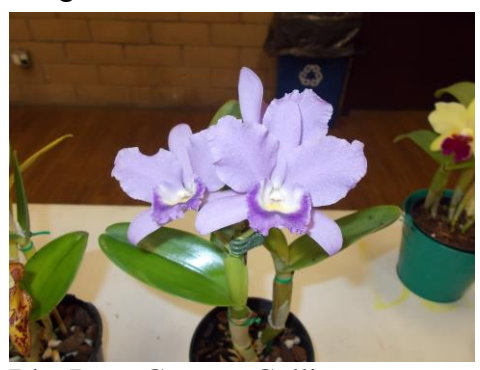
Blc. Boys Grotto - Collins