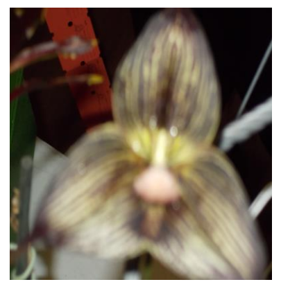
Dracula woolwardae - Dunst