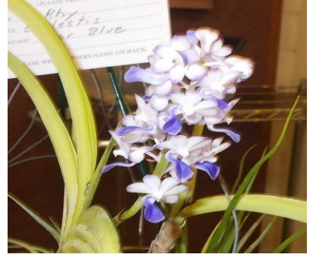
Rhy coelestis – Dunst