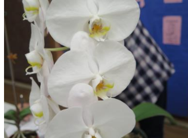
Phal White Dream - Collins