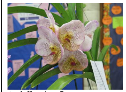
Ascda Kuwaiae – Dunst