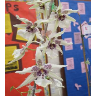
Beallara – Dunst