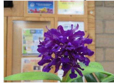
C. Bactia - Laughlin