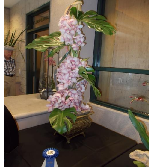
Beautiful arrangement put in by the Guild