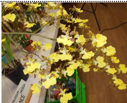
Onc. Flondo Gold – Scoleri