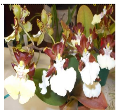
Onc. Splendid - Scoleri