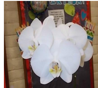
Phal. White Cloud - Laughlin