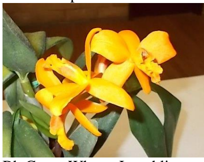
Bk Guess What - Laughlin