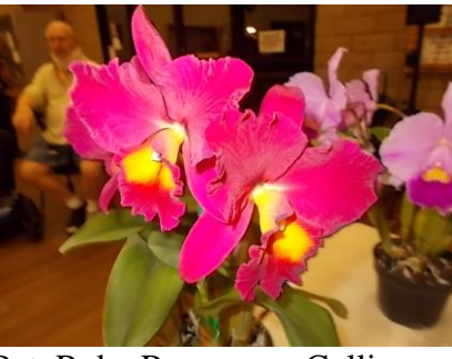
Pot. Ruby Romance - Collins