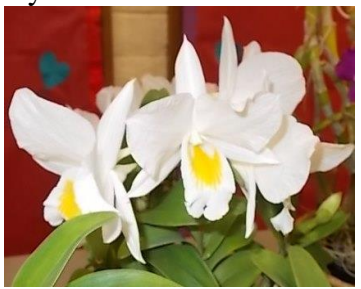
Den Formidable - Collins