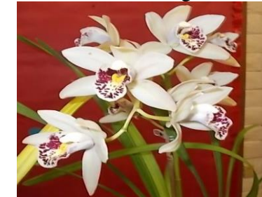
Cym. Pumilum – Laughlin