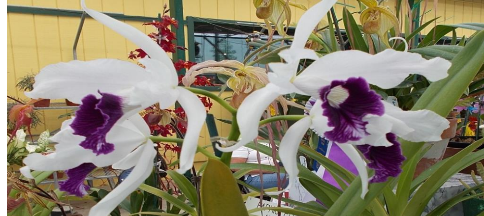
Masd. *noname*-Scoleri Table Display - Linda Lang