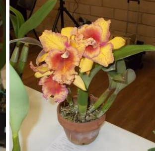
C. Arabesque – Collins