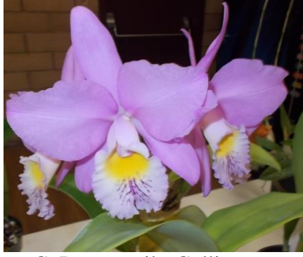
C. Beaumenil - Collins