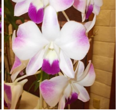
Onc. Heaven Scent - Stewart