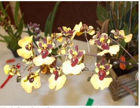
Tol.Getting Orange – Trisler