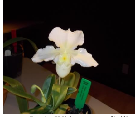
Paph. Whitemoor - Collins