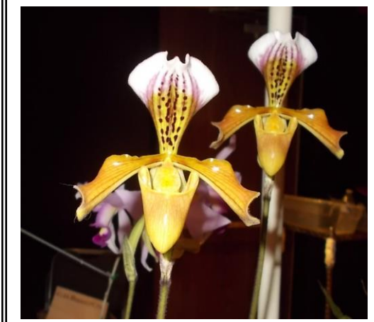
Paph. Gratrixianum – Collins