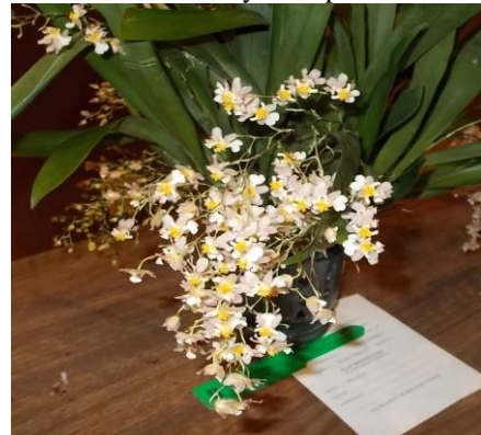
Onc. Twinkle - N. Rosenbaum