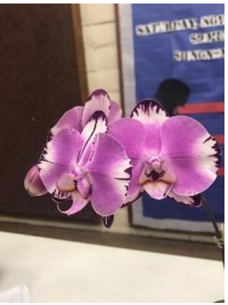
Phal Green Zull - Collins