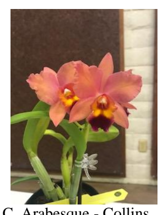
C. Arabesque - Collins