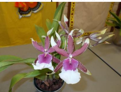
Bllr. Eurostar - Laughlin