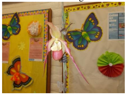
Phrag. Bouley Bay - Collins