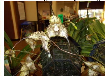
Drac. woolwardiae – Dunst