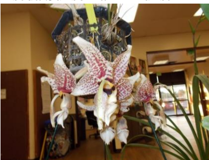
Stan. Tigrina- Dunst