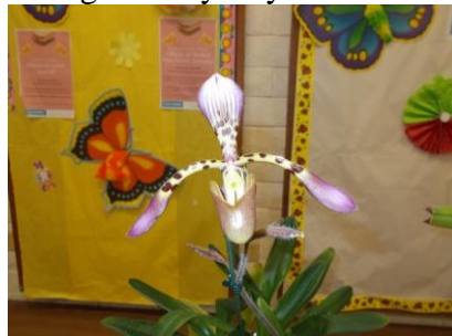
Paph haynaldianum – Laughlin